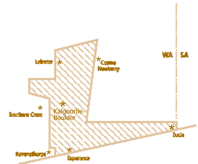
Goldfields Lands Council Area